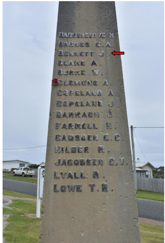
King Island Cenotaph