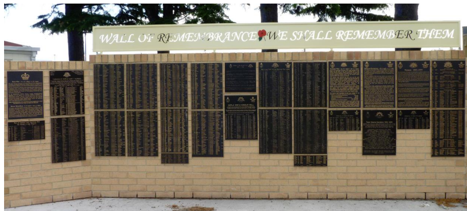
Wall of Remembrance, St. Helens, Tasmania

"What these men did nothing can alter now. The good and the bad, the greatness and the smallness of their story will stand. Whatever of glory it contains nothing now can lessen. It rises, as it will always rise, above the mists of ages, a monument to great hearted men; and for their nation, a possession forever."