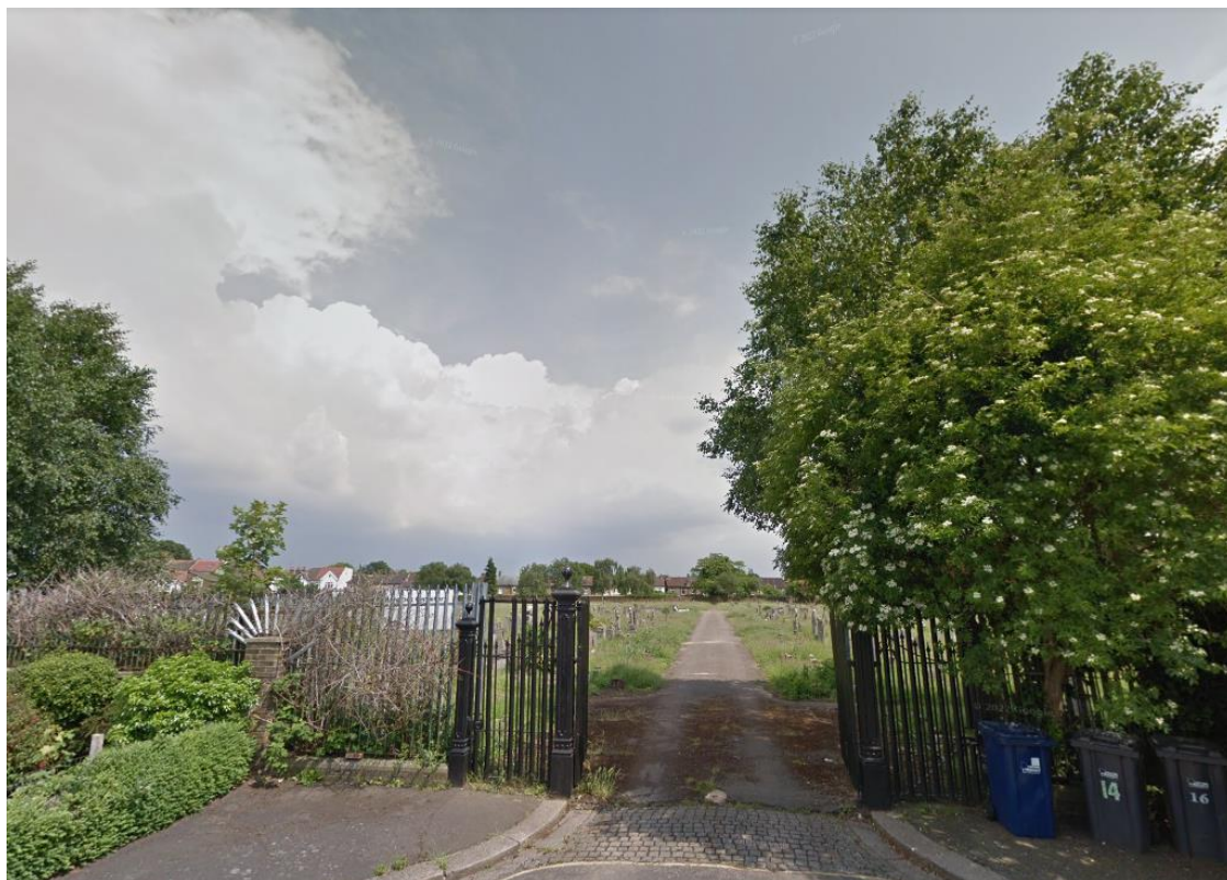
Havelock Cemetery – Church Avenue Entrance

There are 83 Commonwealth War Graves located in Havelock Cemetery, Southall – 39 from World War 1 & 44 from World War 2.