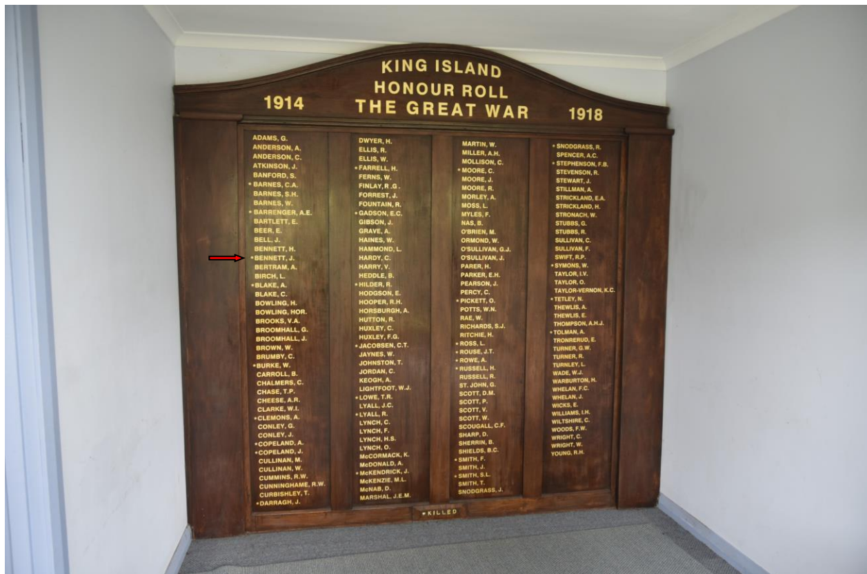
King Island Honour Roll